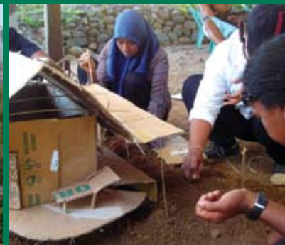
IDEP's GreenHand Sustainable Recovery Field School in Aceh • Children read IDEP 'Disaster Comics' • Delivering effective aid where & when it is most needed • Designing sustainable housing in Aceh