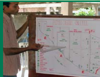
Wise waste management training in local schools • Wastewater Gardens® sewage treatment • Seed saving training in Aceh • Community emergency response map made using IDEP CBDM toolkit